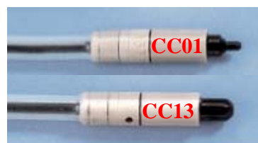
Figure 2: Scanditronix CC01 and CC13 ionization chambers. (Wellhofer, IBA Dosimetry America, Bartlett, TN, USA)

In order to minimize the volume effects our measurements were taken with a CC01 ionization chamber (0.01 cm 3 active volume). In comparison, GBD was obtained with a CC13 ionization chamber (0.13 cm 3 active volume). Figure 2 shows the relative size of these two chambers to scale.